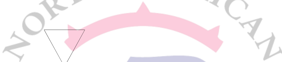
Judges positioned at apex of the triangle

Walk and trot triangle. The legs of the triangle are approximately 40-60 ft. Handlers will present the sportponies clockwise with the handler on the left side of the pony, which is outside of the view of the judges. In the case of a mare and foal being presented together the foal may run loose for the foal to travel the triangle.